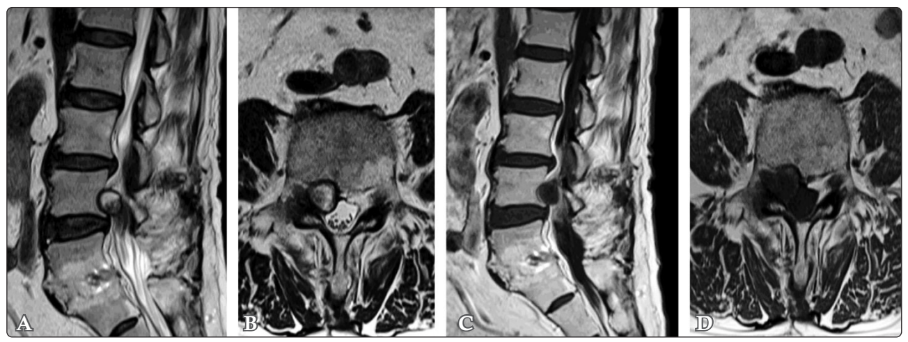
Figure 2. Preoperative sagittal (A) and axial (B) T2-weighted and sagittal (C) and axial (D) T1-weighted MRI images showing facet joint cyst (12 mm in diameter) attached to the medial aspect of the right L4-L5 facet joint and exerting pressure on the posterior aspect of L4 vertebral body and then extends to the spinal canal and intervertebral foramen.