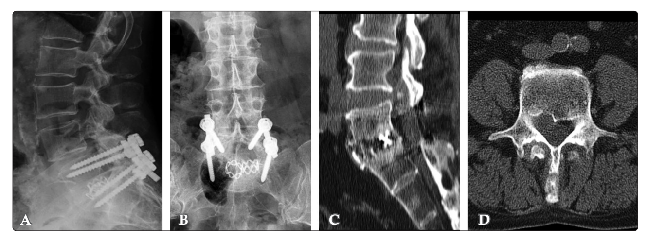
Figure 1. Preoperative X-ray lateral (A) and AP (B) views showing well-fused L5/S1 level. Preoperative CT scan: sagittal reformat (C) and axial image (D) showing erosion of the adjacent posterior surface of L4, which may represent pressure atrophy. No abnormal calcification is noted.