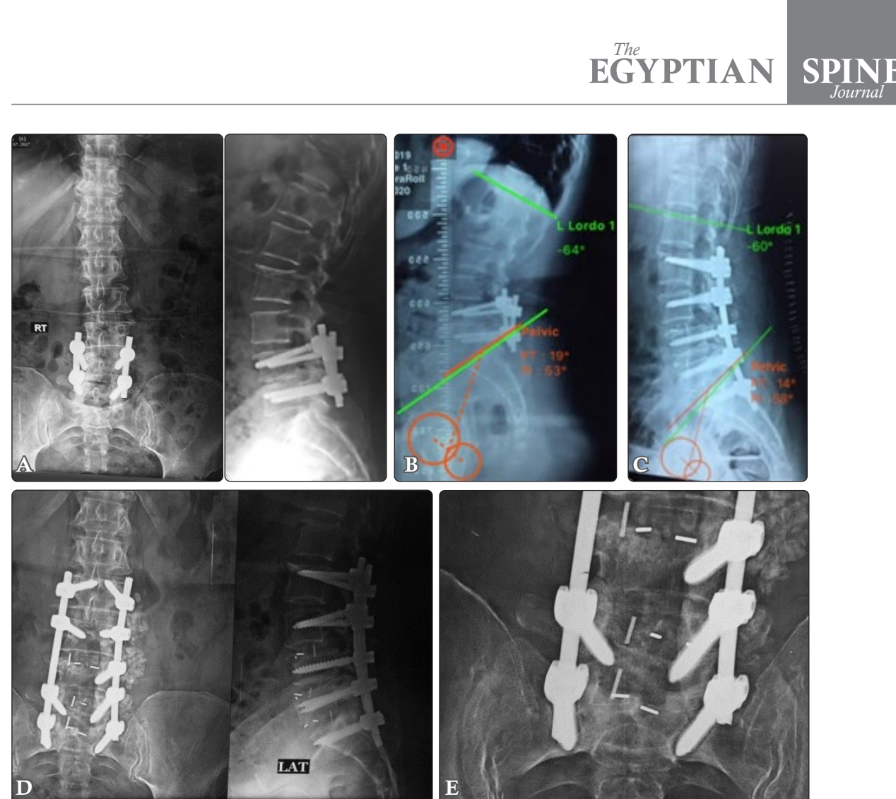
Figure 2. (A) Preoperative AP and lateral X-ray. (B) Preoperative lateral X-ray with measurement of LL: -64; PI: 53; PT: 19. (C) Postoperative lateral X-ray showing measurement LL: -60; PI: 53; PT: 14. (D) and (E) Final follow-up X-ray showing S1 loosening of the screw.