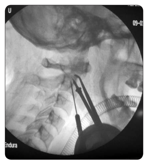
Figure 4. A technical maneuver used in a case with persistent anterior displacement of the odontoid fragment. A Caspar pin inserted and an angled curette into the fracture to pull the C2 body anteriorly.

anteriorly with the help of a curved curette within the fracture. This maneuver was successful and allowed obtaining an anatomical reduction. To the best of our knowledge, this technical maneuver has not been described before (Figure 4).