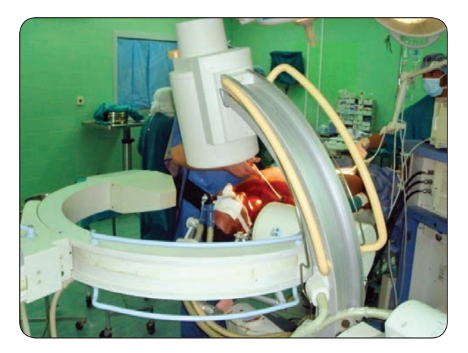
Figure 1. The layout of the operating room; 2 image intensifiers positioned and fixed with the patient's head fixed with a Mayfield frame.

Mayfield frame is performed under fluoroscopy control to obtain an anatomical reduction of the odontoid fracture. Once that is achieved, the frame is tightened securely. A long K wire is used to rehearse the position of the guide wire and trajectory of access to the odontoid. This rehearsal is a vital step to make sure that the patient's chest is not too high to block a proper access and alignment of the odontoid screw.