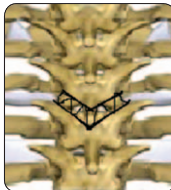
Figure 2. The V shaped osteotomy of the dorsal spine. The shaded area is removed from the posterior elements to allow closure of the osteotomy achieved by posterior compression of adjacent pedicle screws.