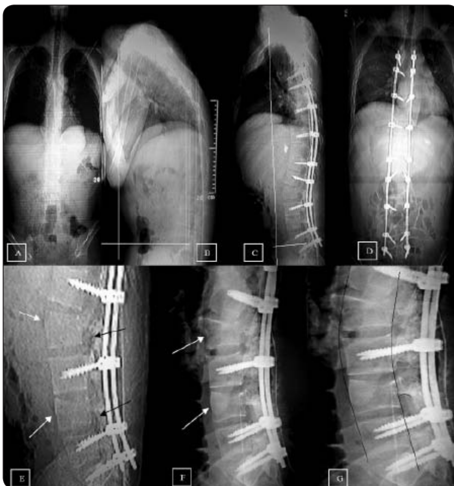
Figure 3. Male patient, 38 years old, ankylosing spondylitis with sagittal imbalance. (A), (B) Preoperative long film spine scanogram with the vertical plumb line in white color. (C), (D) Postoperative spine scanogram with improvement of vertical plumb line distance (E), (F), (G) Postoperative Lumbar spine showing osteotomy at LV2, LV4 with smooth correction of lumbar spine with no evidence of subluxation at the level of osteotomy (black lines in (G)). The inferior smooth pedicle wall is preserved with unchanged vertical dimension of the intervertebral foramen (black arrows) and complete closure of the wedge osteotomy (white arrows).